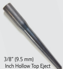
3/8" (9.5 mm) Inch Hollow Top Eject Tine