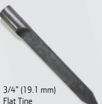
3/4" (19.1 mm) Flat Tine