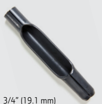
3/4" (19.1 mm) Fairway Side Eject Tine (Rolled)