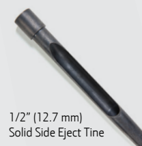
1/2" (12.7 mm) Solid Side Eject Tine