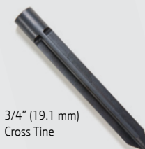
3/4" (19.1 mm) Cross Tine