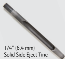
1/4" (6.4 mm) Solid Side Eject Tine