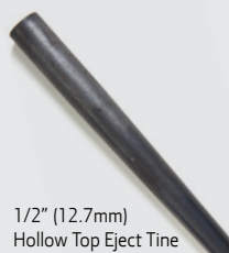
1/2" (12.7 mm) Hollow Top Eject Tine