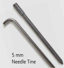
5 mm Needle Tine