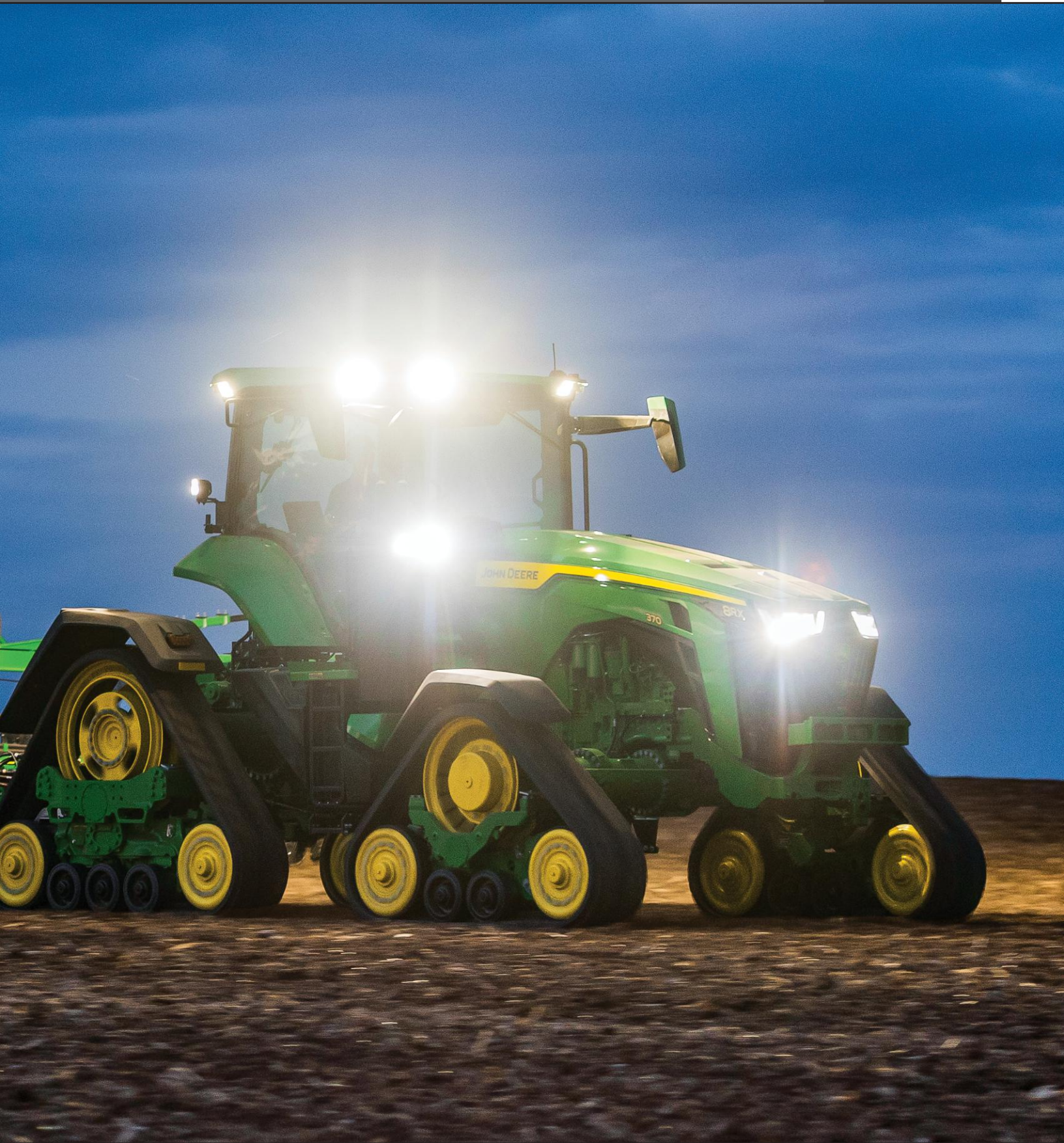
Ultimate Visibility package shown.